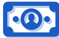
Lost wages or lost support

Family members may be eligible to apply for compensation depending on state regulations and the nature of the crime. Please contact your local Child Advocacy Center for information on your state's specific Victims' Compensation eligibility standards. More information is available at www.ovc.gov .