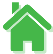
Loss of essential personal property