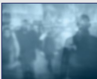
Missing and Unidentified Persons Conference