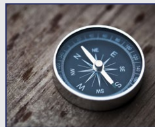
Law Enforcement Administrative Professionals Conference (Illinois, Ohio, and Wisconsin)