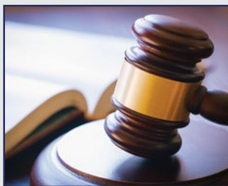
Court Safety and Security Conference

Looking for a conference to attend? We've got them!