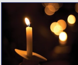
Wisconsin Serving Victims of Crime Conference