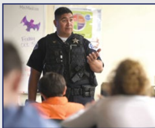
School Resource Officer Training Conference